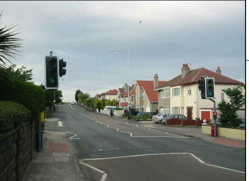
Example of a Puffin Controlled Crossing

NOTES 1. All dimensions are in metres unless shown otherwise and should not be scaled from the drawing. 2. New road layout will include warning signs.